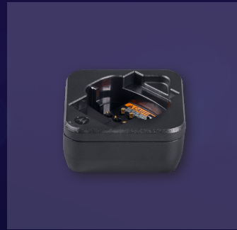
PMPN4587 SINGLE-UNIT CHARGER