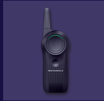
PMPN4589 CURVE RADIO